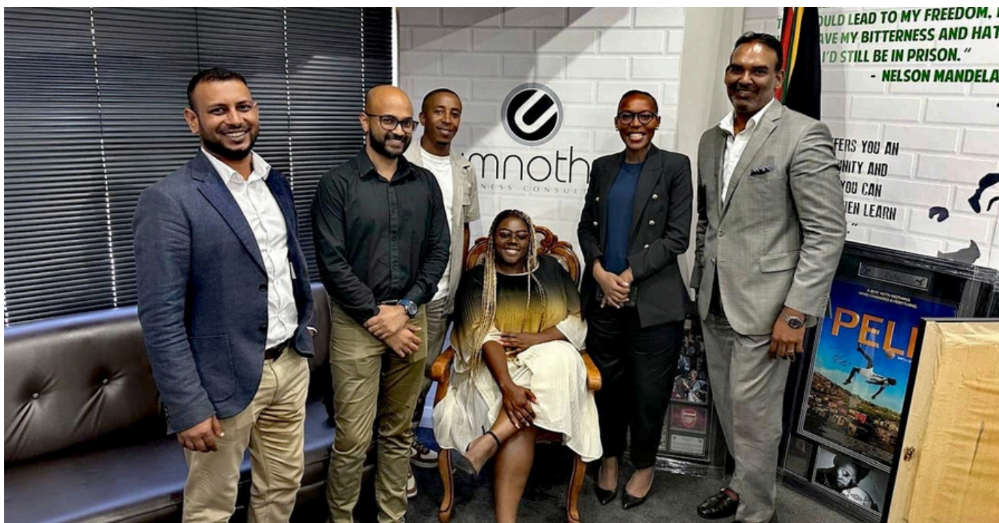
Photo: Umnotho and SAIGA Technical team at Umnotho training office .

The Southern African Institute of Government Auditors (SAIGA) has embarked on a series of site visits to assess training offices, ensuring they meet necessary requirements and provide quality training environments.